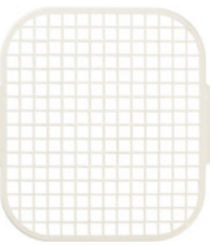
3023 Cleaning for 3080 EAN 7350007792013 • PS 50604