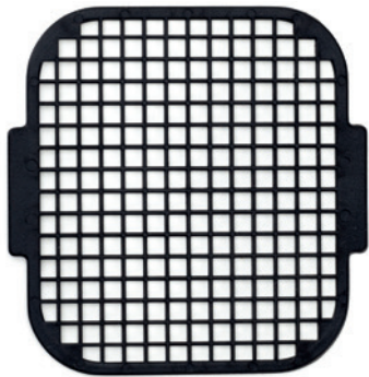
309606 Cleaning grid for 3093 6mm EAN 7350007792464 • PS 50759