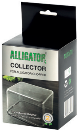
3074 Collector for 3071 & 3079 EAN 7350007792037 • PS 62759 Master carton 48 pcs (4x12)