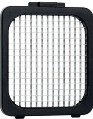
309506 Blade frame for 3093 6mm EAN 7350007792174 • PS 65956