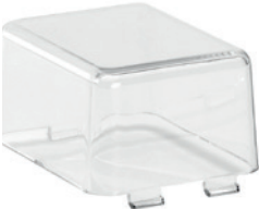
1075 Collector for 3080 EAN 7350007792044 • PS 51956 Master carton 48 pcs (4x12)