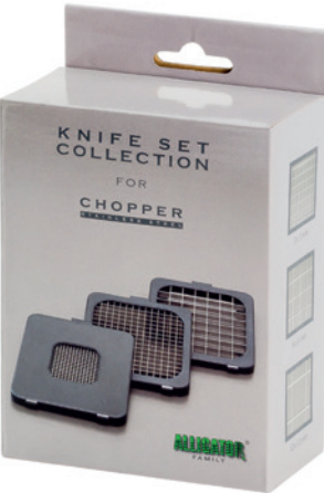
3098 Complete Knife Set for 3093 EAN 7350007792242 • PS 515950