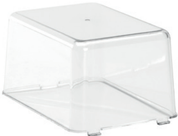
1078 Collector for 3093 EAN 7350007792068 • PS 83452 Master carton 50 pcs