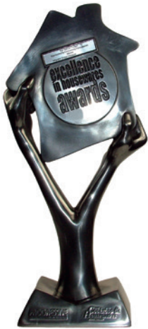
Award Winner - Top Gadget of the Year EXCELLENCE IN HOUSEWARES Birmingham - UK