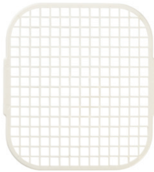
1055 Cleaning grid for 3071 & 3079 EAN 7350007792525 • PS 70606