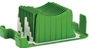
2020 C+D Slicing block and cleaning grid 2020 EAN 7350007792020 • PS 4406